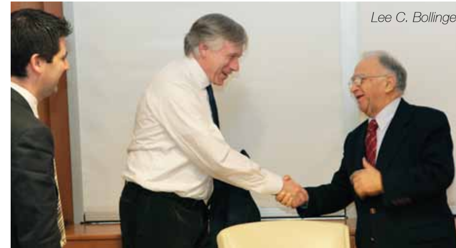
Lee C. Bollinger