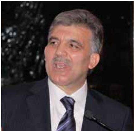
H.E. Abdullah Gül President of the Republic of Turkey

GRF invites prominent global leaders to discuss the key issues of our time. During our first year, we had the honour of welcoming several distinguished speakers.