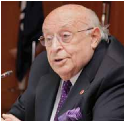
H.E. Süleyman Demirel Former President of the Republic of Turkey

“Given today’s global circumstances, it is clear that limiting the concept of Europeaness to a narrow geography, a specific belief or culture is not possible. Instead of focusing on past conflicts and problems or trying to construct new and artificial fault lines, it is necessary for us to think about a common future and vision and look forward in unity.”