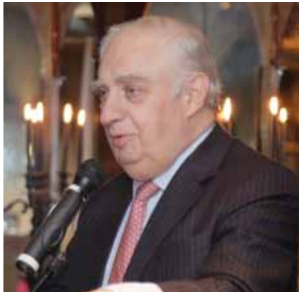
Peter Sutherland Chairman of Goldman Sachs International and Former Director-General of the World Trade Organisation (WTO)

“The biggest challenge facing globalization is the elimination of poverty. It is impossible to maintain world peace if countries overlook the fight against poverty. A world which fails to defeat poverty and ignorance will inevitably face terrorism.”