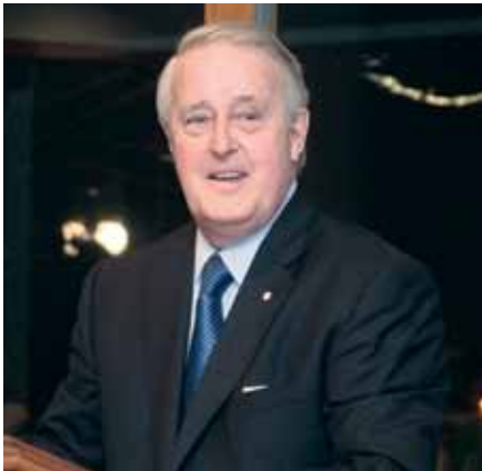
The Right Honourable Brian Mulroney Former Prime Minister of Canada

“I am a very committed European integrationist. I believe in a federal Europe. I believe that the movement towards European integration has been the most marvelous political step taken in the history of this continent, which has been at the cockpit of conflict for so long.”